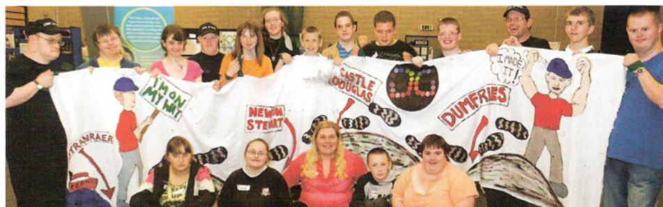
Members of the Cree Sound group